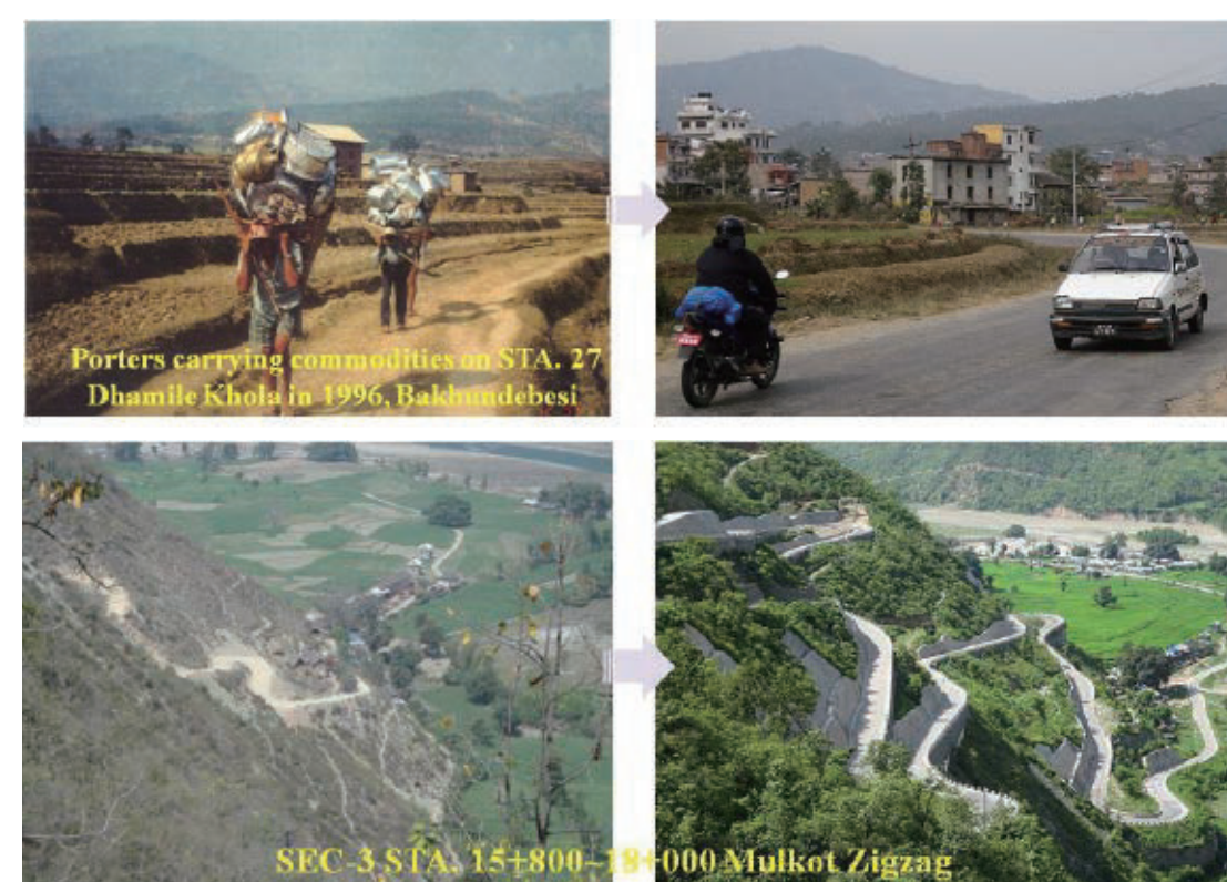
Before and After the Construction of the Sindhuli mountainous Road, Nepal