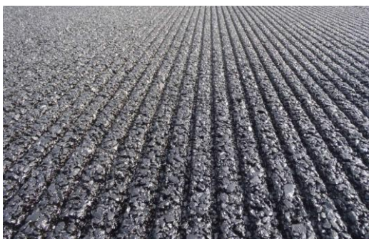
Example of longitudinally grooved rough-surface finish

Full Function Pave (FFP) is a longitudinally grooved rough-surface hybrid pavement. Its hybrid structure, consisting of a drainage layer and a waterproofing layer, is formed within a single asphalt paving mixture during a single construction process. The pavement surface is finished into a longitudinally grooved rough surface by using an asphalt finisher equipped with a compaction device modified specifically for this application. Longitudinally grooved rough-surface finish enhances vehicle stability under wet weather and other difficult-to-drive conditions and contributes to other improvements, such as freezing prevention, noise reduction, and visibility improvement. FFP has also proved to be effective in reducing traffic accidents.