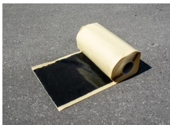
“Fine Sheet” Appearance