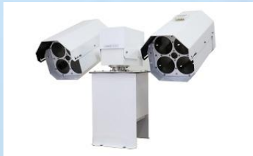
Former Road Eye

Determining the road surface condition in winter in real time!