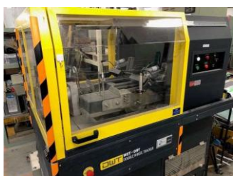
HWT test equipment