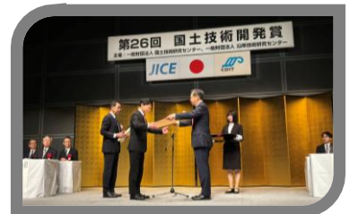
Infrastructure Technology Development Award