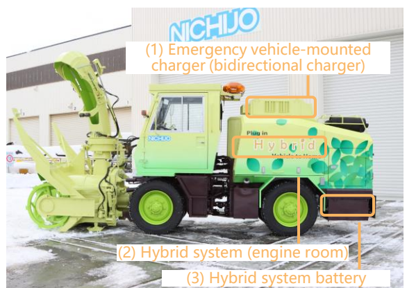
(Dedicated configuration of plug-in hybrid equipment)