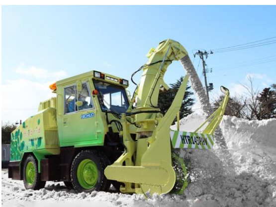
(Snow removal operation)