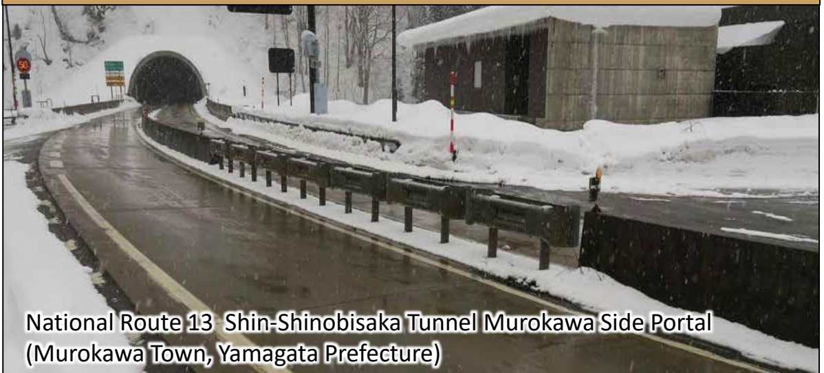
National Route 13 Shin-Shinobisaka Tunnel Murokawa Side Portal (Murokawa Town, Yamagata Prefecture)