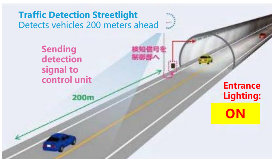
Introduction of Sensor Lighting