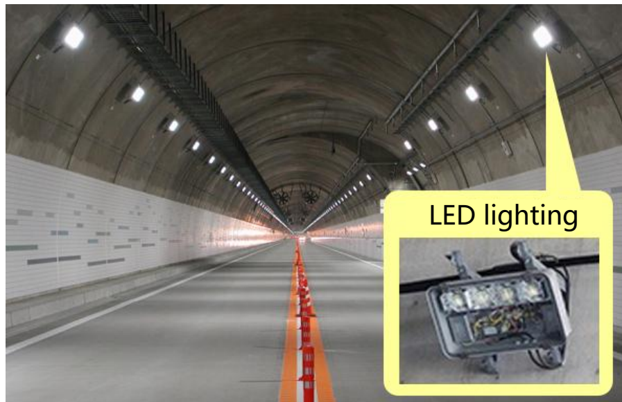
Switching to LED Lighting

We actively introduce new technologies throughout the entire lifecycle of roads to reduce CO 2 emissions .