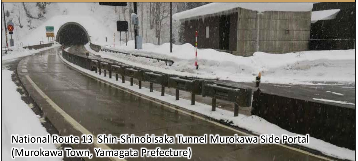
National Route 13 Shin-Shinobisaka Tunnel Murokawa Side Portal (Murokawa Town, Yamagata Prefecture)